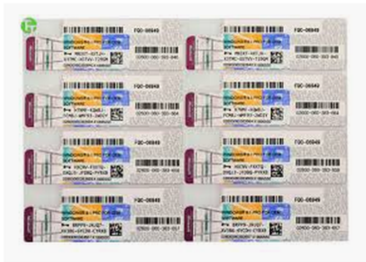
English Windows 8.1 Product Key Sticker ... softwaresoem.com