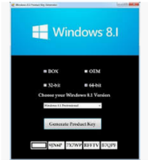
Windows 8.1 Product Key Gene... activationkeys.org